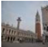
“The Doge Palace”

An interesting and a deepen visit of one of the most important building of Venice: The Doge Palace. The guide will show you the beautiful rooms and history of this unique building